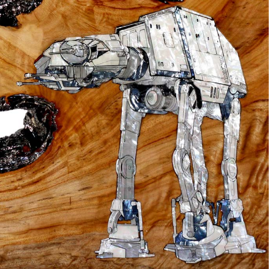
Ted Lincoln - Detail Shot "Edor Base Garrison Engage" Mother or Pearl inlay on camphor with painted chrome edges